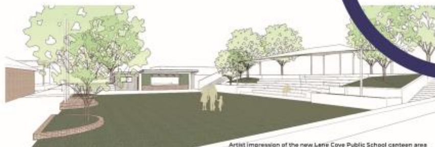
Artist impression of the new Lane Cove Public School canteen area